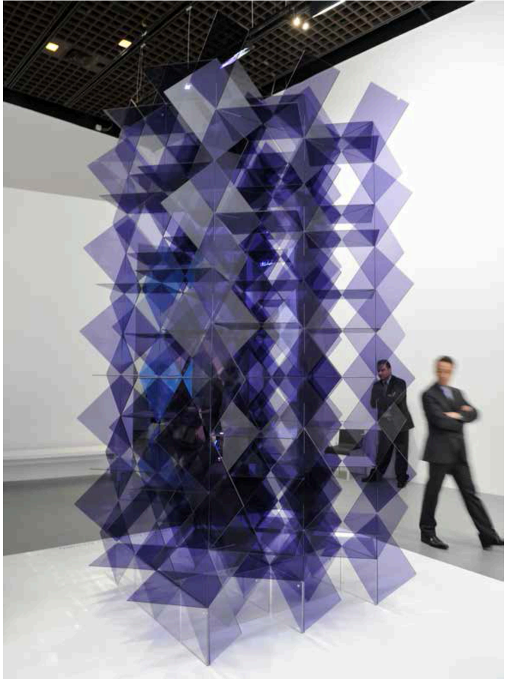
Vue de l'exposition Dynamo , Grand Palais, Paris, 2013 / Exhibition view, Dynamo , Grand Palais, Paris, 2013