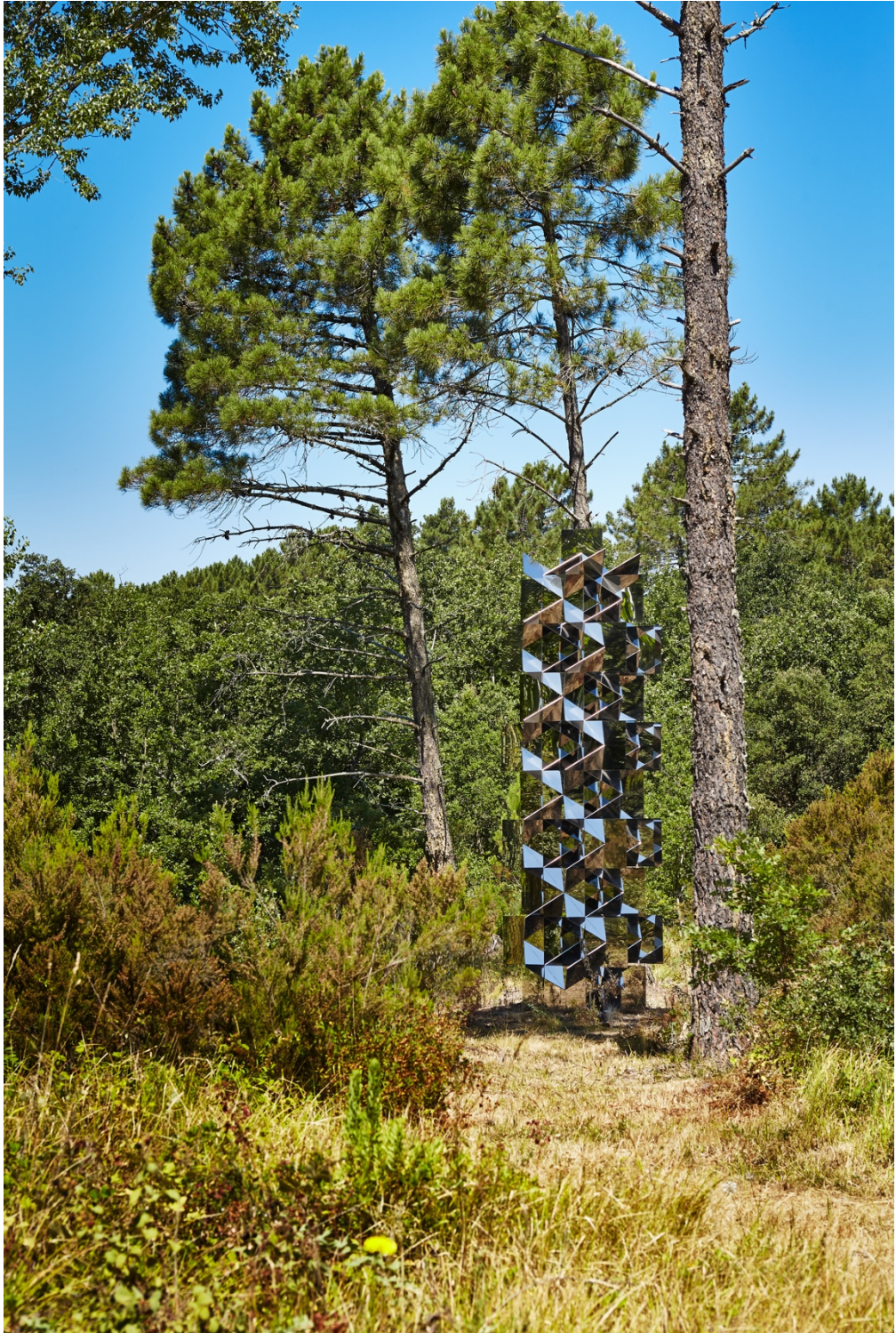
Francisco Sobrino Structure permutationnelle, Acier poli miroir / Mirror-polished stainless steel H 600 x 180 x 180 cm Unique