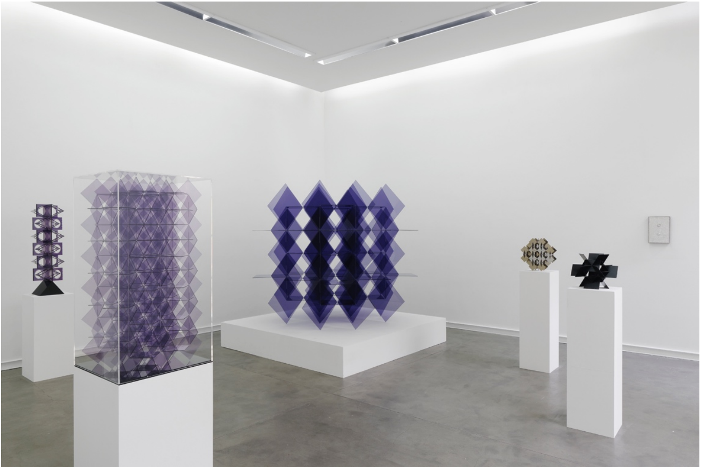
Vue de l'exposition Modus Operandi , Galerie Mitterrand, Paris, 2017 / Exhibition view, Modus Operandi , Galerie Mitterrand, Paris.

79 RUE DU TEMPLE 75003 PARIS - T +33 1 43 26 12 05 F +33 1 46 33 44 83 INFO@GALERIEMITTERRAND.COM WWW.GALERIEMITTERRAND.COM